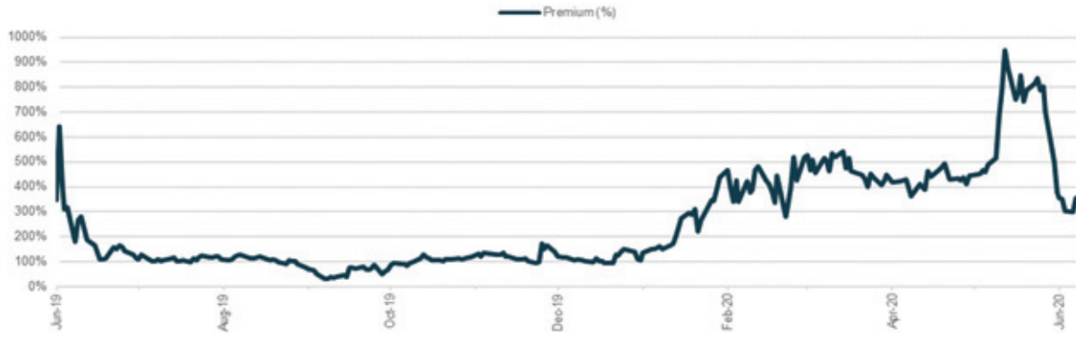
ETHE Premium: ETHE Share Price vs. Digital Asset Holdings per Share (%)

The following chart sets out the historical premium and discount for the Shares as reported by OTCQX and the Trust's Digital Asset Holdings per Share.