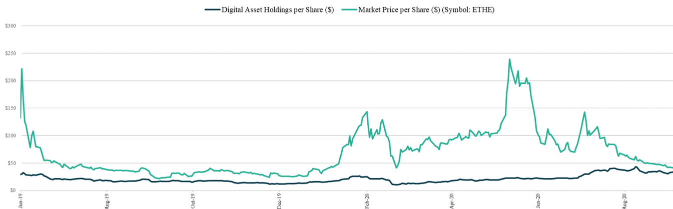
ETHE Premium: ETHE Share Price vs. Digital Asset Holdings per Share ($)

The following chart sets out the historical closing prices for the Shares as reported by OTCQX and the Trust’s Digital Asset Holdings per Share.