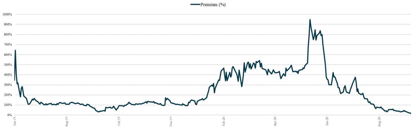
ETHE Premium: ETHE Share Price vs. Digital Asset Holdings per Share (%)

The following chart sets out the historical premium and discount for the Shares as reported by OTCQX and the Trust's Digital Asset Holdings per Share.