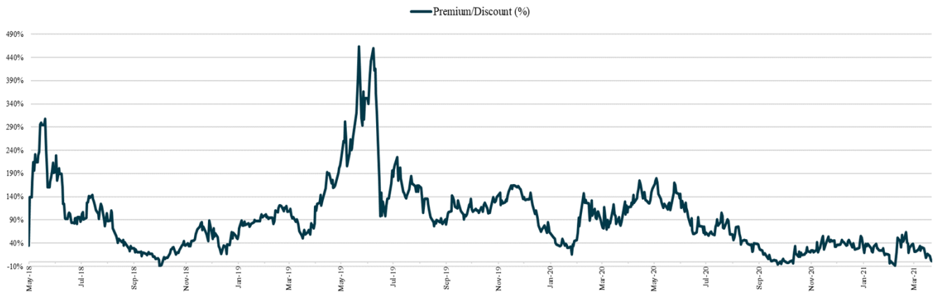
ETCG Premium/(Discount): ETCG Share Price vs. Digital Asset Holdings per Share (%)

The following chart sets out the historical premium and discount for the Shares as reported by OTCQX and the Trust’s Digital Asset Holdings per Share.