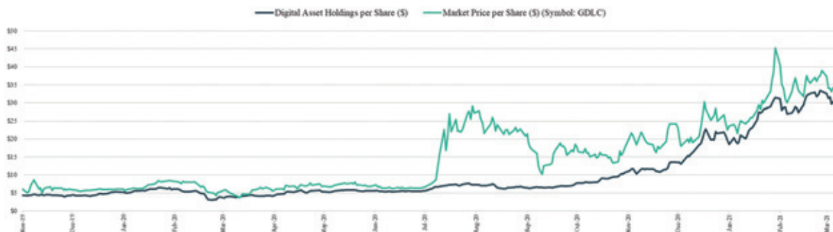
GDLC Premium: GDLC Share Price vs. Digital Asset Holdings per Share ($)

The following chart sets out the historical closing prices for the Shares as reported by OTCQX and the Fund’s Digital Asset Holdings per Share.