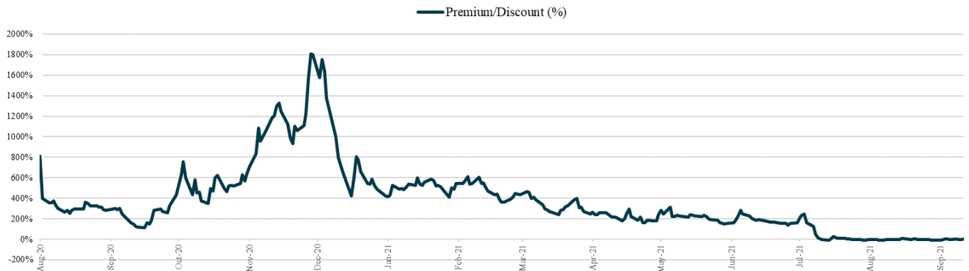
BCHG Premium/(Discount): BCHG Share Price vs. Digital Asset Holdings per Share (%)

The following chart sets out the historical premium and discount for the Shares as reported by OTCQX and the Trust’s Digital Asset Holdings per Share.