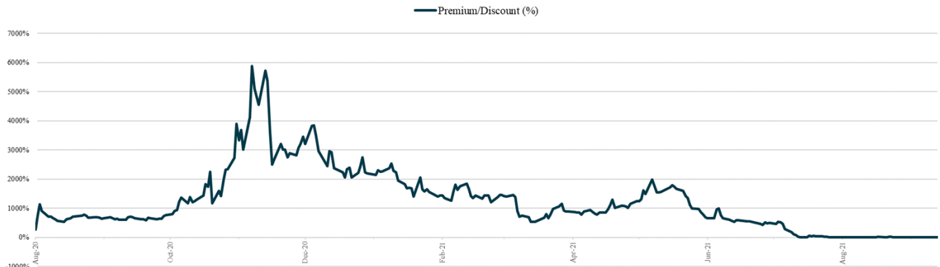
LTCN Premium/(Discount): LTCN Share Price vs. Digital Asset Holdings per Share (%)

The following chart sets out the historical premium and discount for the Shares as reported by OTCQX and the Trust’s Digital Asset Holdings per Share.