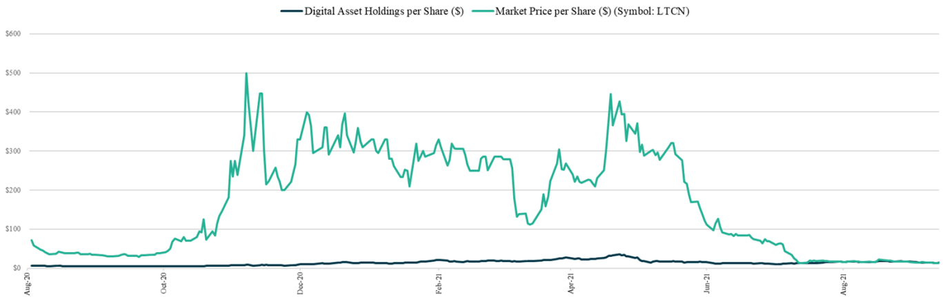
LTCN Premium/(Discount): LTCN Share Price vs. Digital Asset Holdings per Share ($)

The following chart sets out the historical premium and discount for the Shares as reported by OTCQX and the Trust’s Digital Asset Holdings per Share.