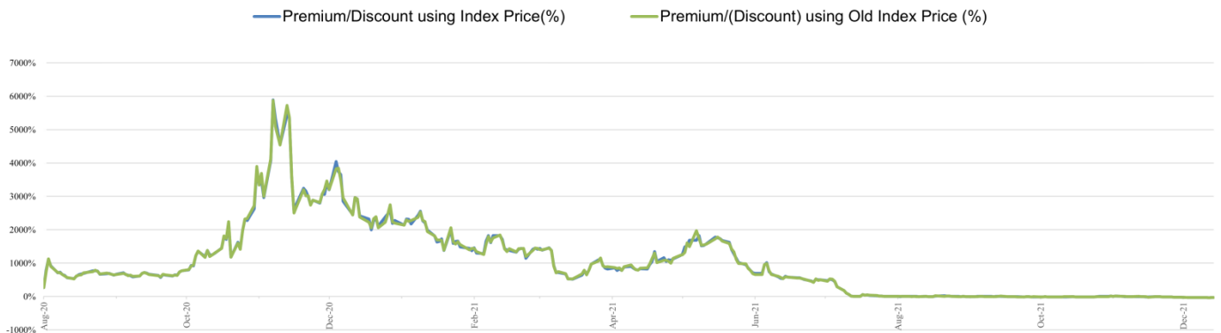
LTCN Premium/(Discount): LTCN Share Price vs. Digital Asset Holdings per Share (%)

The following chart sets out the historical premium and discount for the Shares as reported by OTCQX and the Trust’s Digital Asset Holdings per Share based on the Index Price and the Old Index Price.