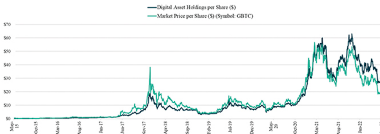
GBTC Premium/(Discount): GBTC Share Price vs. Digital Asset Holdings per Share ($)

The following chart sets out the historical closing prices for the Shares as reported by OTCQX and the Trust's Digital Asset Holdings per Share.