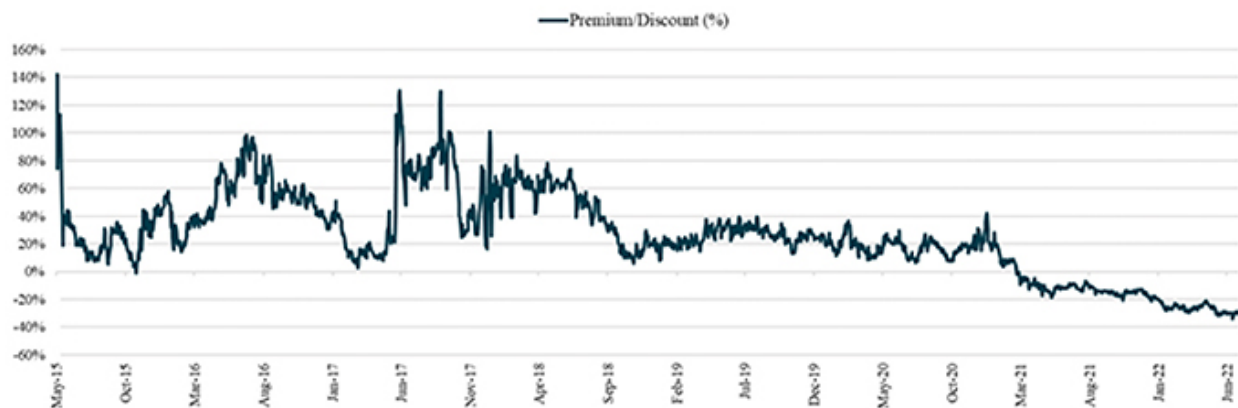
GBTC Premium/(Discount): GBTC Share Price vs. Digital Asset Holdings per Share (%)

The following chart sets out the historical premium and discount for the Shares as reported by OTCQX and the Trust's Digital Asset Holdings per Share.